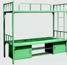
Size: L6' x W2½' & L6' x W3'x H5'