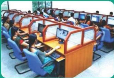
Siva Institute of Frontier Technology