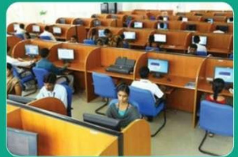
Amrita Vishwa Vidyapeetham