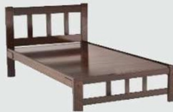
Size: L6.25'xW 3'