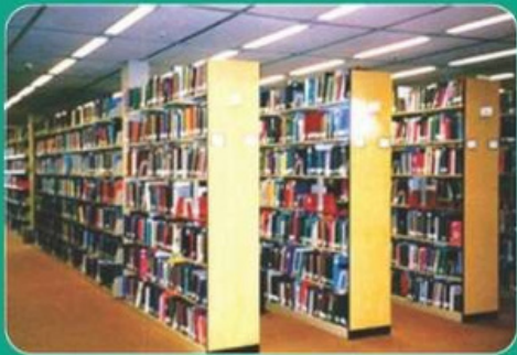
PT LEE Chengalvarayan College