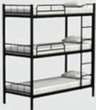
Size: L6'xW3' xH 7¼'