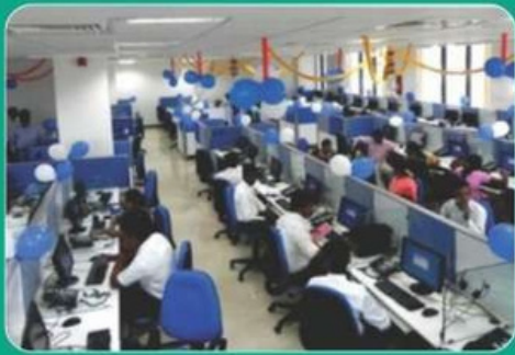
Amtex Info Tech Solution