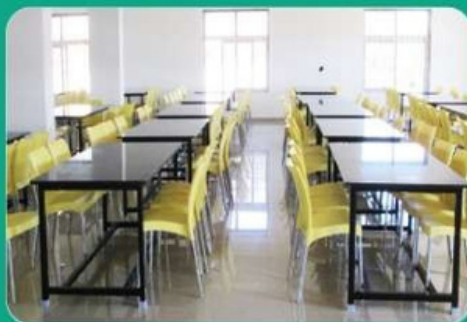
Vel Tech Engg College