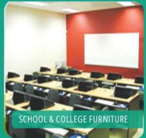
SCHOOL & COLLEGE FURNITURE