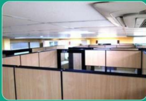
Tamil Virtual Academy