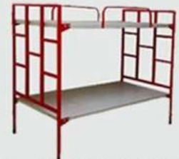
Size: L6'x W2½' & L6'xW 3'xH 5'