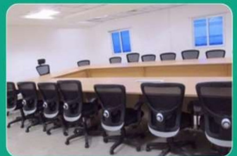
Chennai Metro Rail Limited