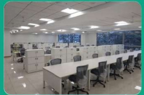
IIIT - Bangalore