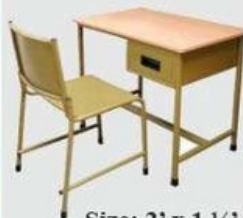
Size: 2' x 1 ¼'