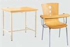
Size: 3'x2' & 4' x 2'