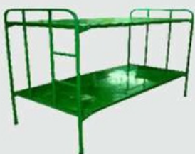
Size: L6'x W2½' & L6'xW 3'xH 5'