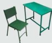
Size: 2' x 1 ¼'