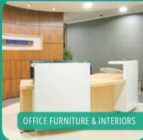
OFFICE FURNITURE & INTERIORS