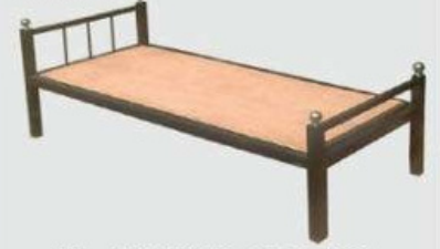
Size: L6' xW2½' & L6' xW3'