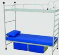
Size: L6'xW 2½' & L6' x W3'x H5'