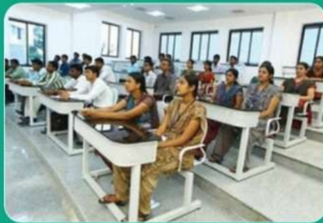
Saveetha Engineering College