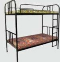
Size: L6' x W2½' & L6'x W3'x H5'