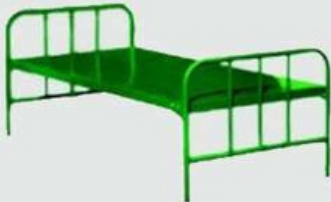
Size: L6' x W2.5' & L6' x W3'